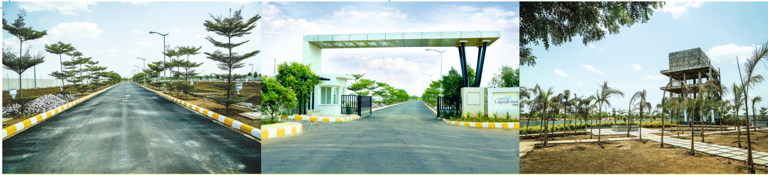
Actual Site Images